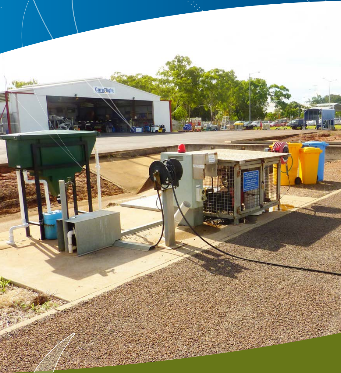
Pollution control device at the Darwin International Airport.